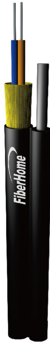
Figure-8 Round Type Cable